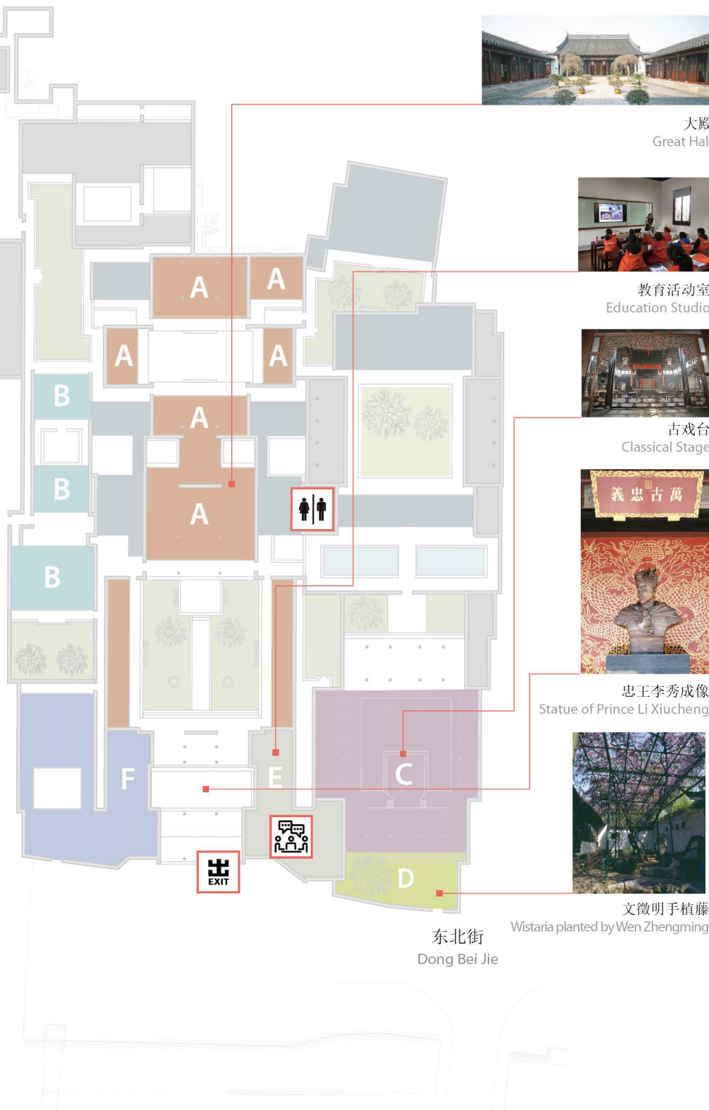
大殿 Great Hall